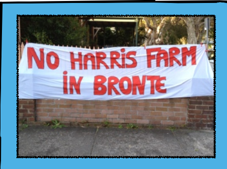
HARRIS FARM NOT WANTED We don't need, nor want, a